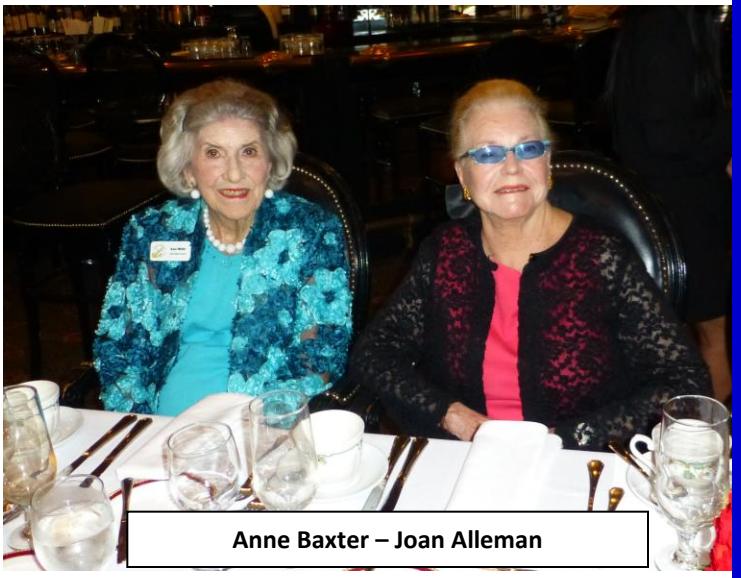
Anne Baxter – Joan Alleman