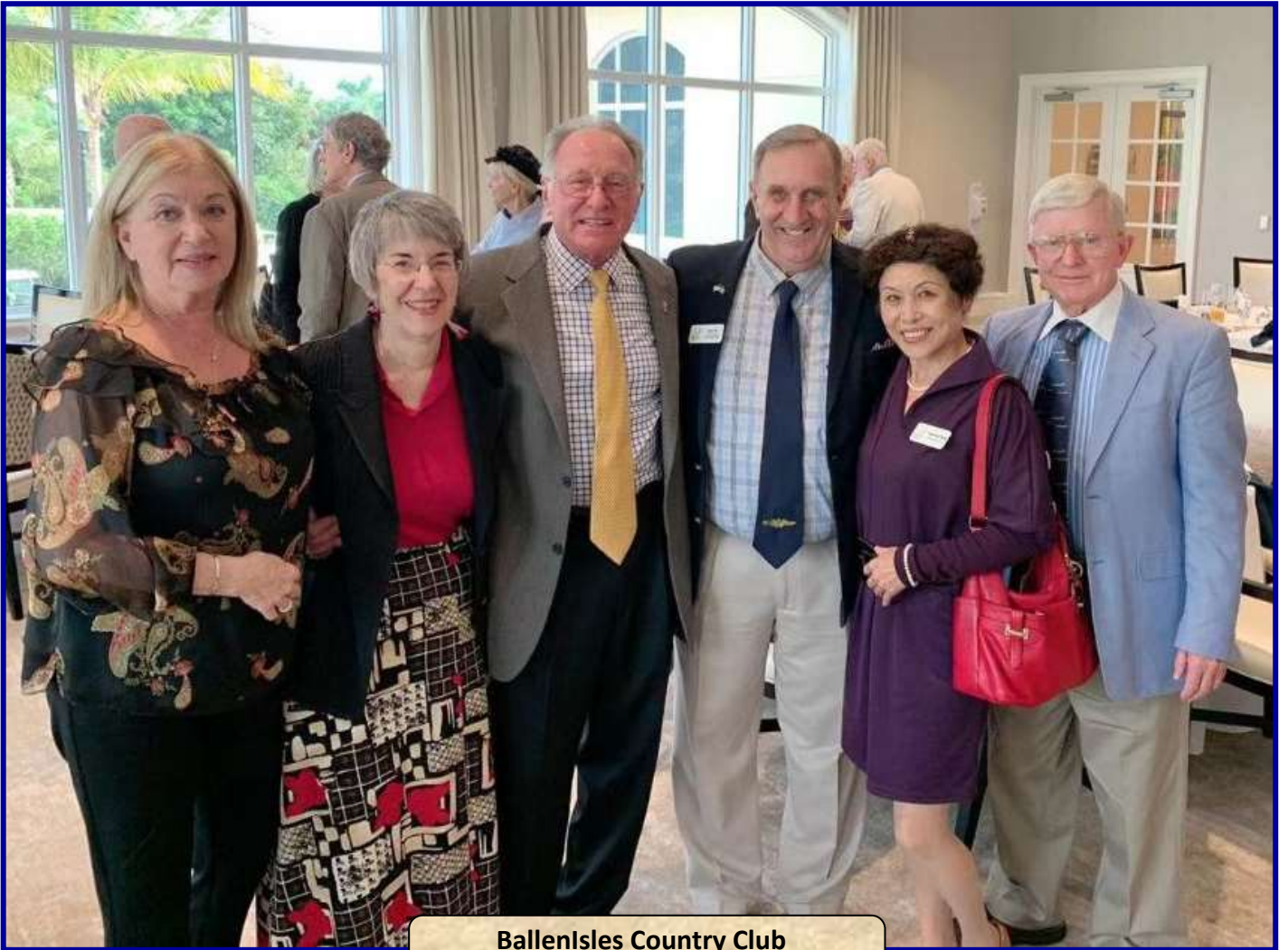
BallenIsles Country Club Jan 22, 2020