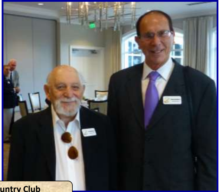
BallenIsles Country Club Jan 22, 2020