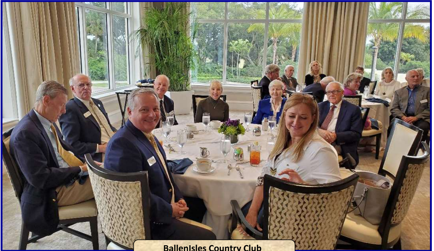
Ballen Isles Country Club Jan 22, 2020