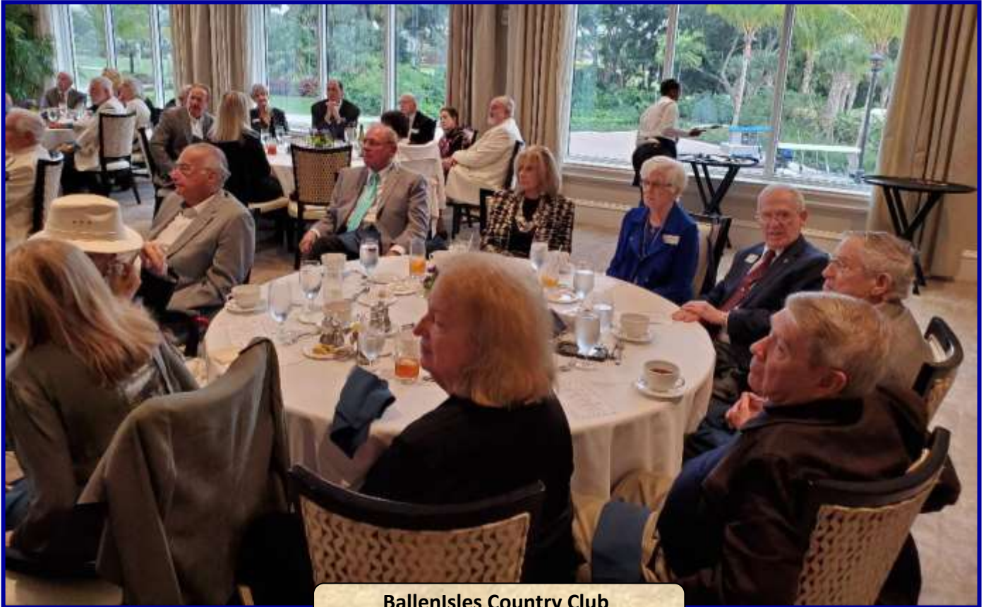
Ballenises Country Club Jan 22, 2020