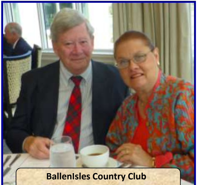
Ballensles Country Club Jan 22, 2020