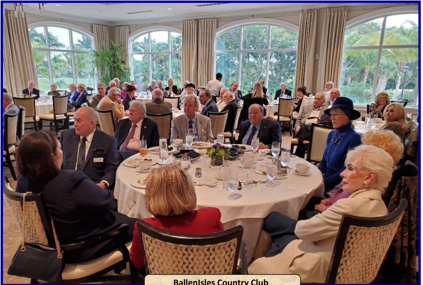
BallenIsles Country Club Jan 22, 2020