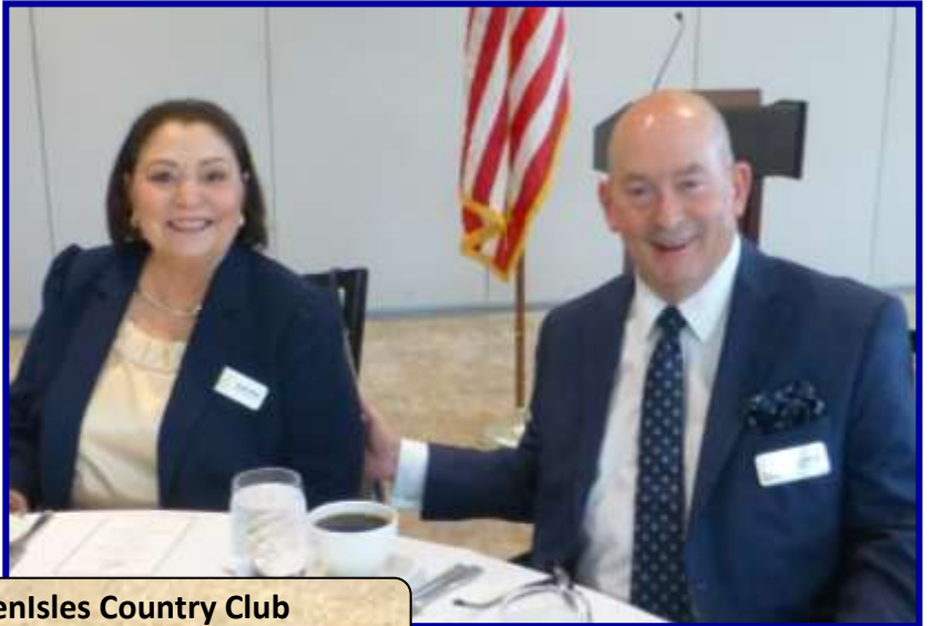
BallenIsles Country Club Jan 22, 2020