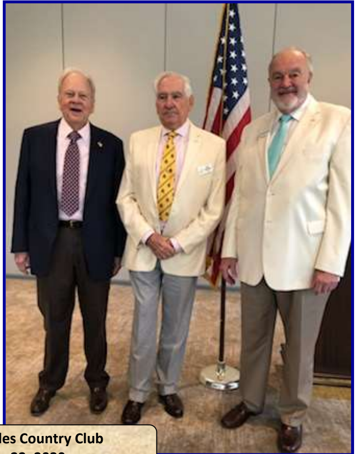
BallenIsles Country Club Jan 22, 2020