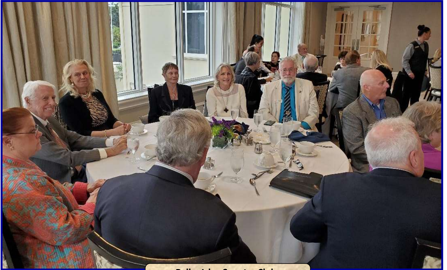
BallenIsles Country Club Jan 22, 2020