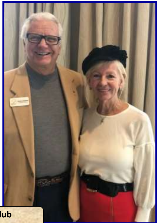
BallenIsles Country Club Jan 22, 2020