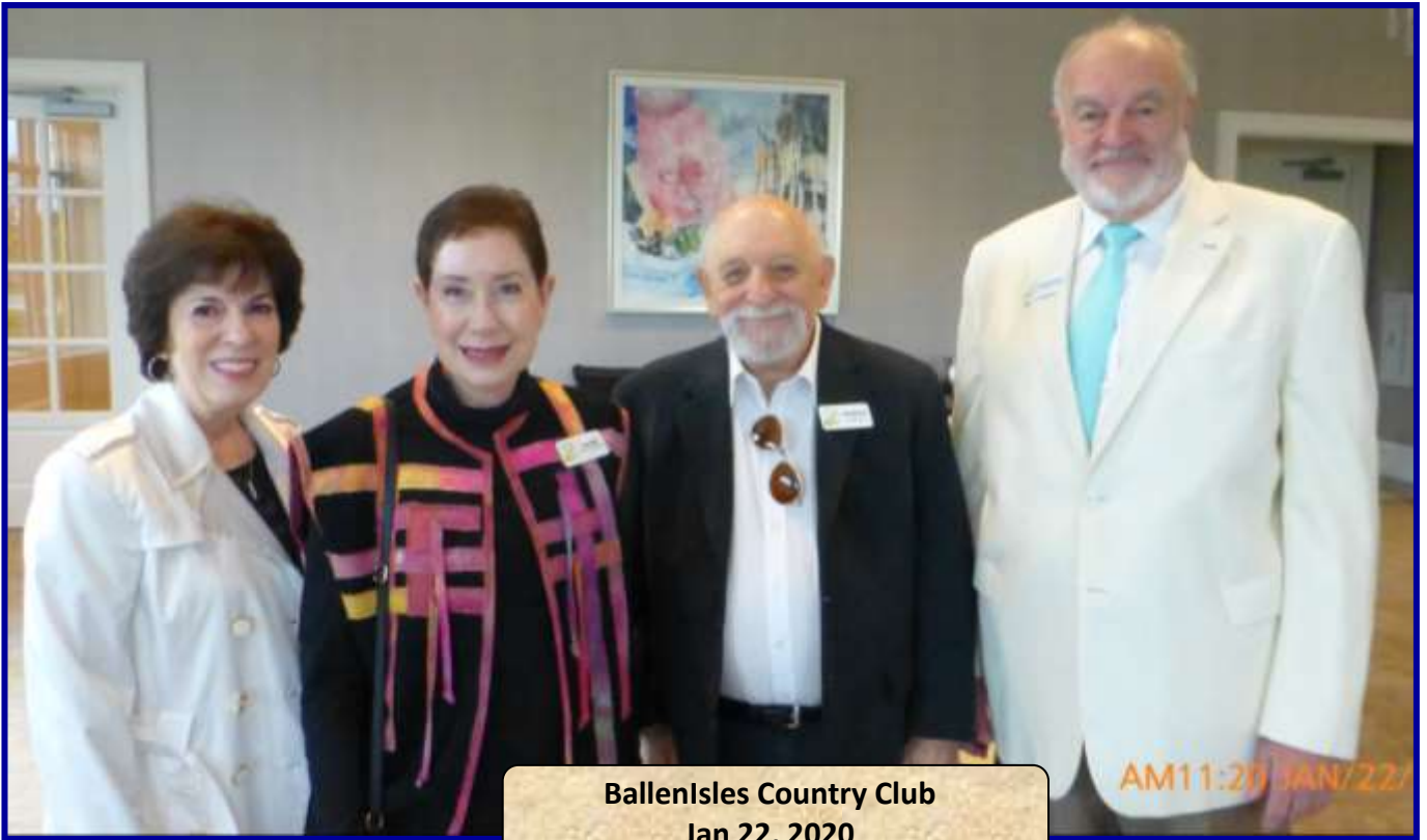
BallenIsles Country Club Jan 22, 2020