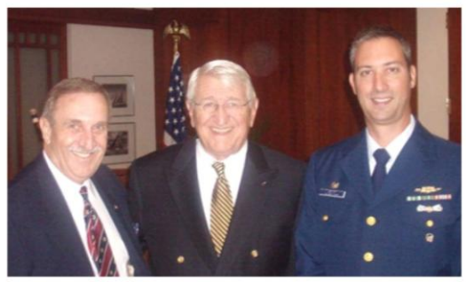
January Installation Luncheon Sailfish Club