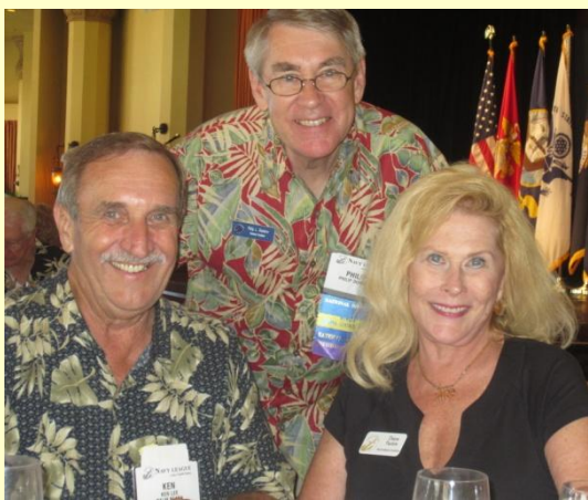
JUNE National Convention Honolulu