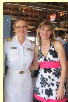
JUNE Tiki Hut Navy Reserves IA Appreciation Dinner