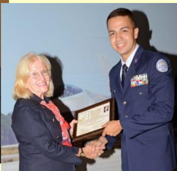
MAY Inaugural Norman Daly Scholarships