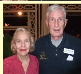
SEP Taboo Cocktails