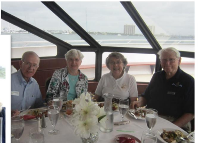
FEB Intracoastal Cruise w/ MOAA M/Y Majestic Princess