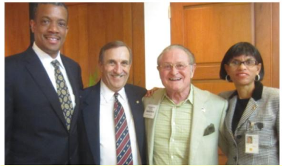
FEB Port of Palm Beach Luncheon Sailfish Club