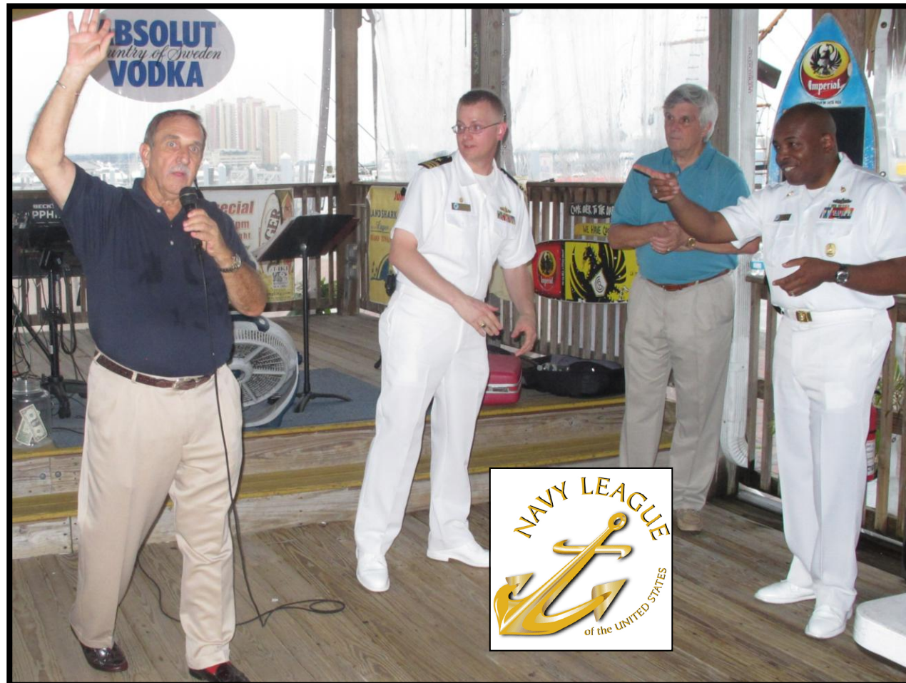
Wait a minute! ..... I forgot something .... again!