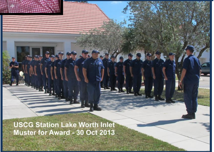
USCG Station Lake Worth Inlet Muster for Award - 30 Oct 2013