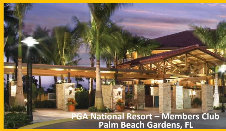
PGA National Resort – Members Club Palm Beach Gardens, FL